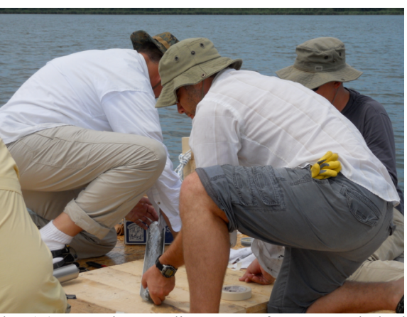
(L) Getting the platform into position in Sarikum lake; (R) Wrapping a sediment core for geomorphological and environmental analysis in the United States.