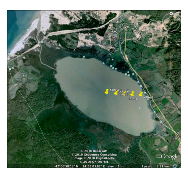
Sample map showing the locations of sediment cores taken at Sarikum lake during 2010

We obtained 40 meters of sediment cores from Sarikum that will enable us to study changing proportions of pollen and erosion of soils associated with the spread of farming in the region. We are conducting similar environmental studies in several areas of the promontory in order to understand the diverse patterns of land use including agriculture and forest clearance across the promontory over the past 5,000 years.